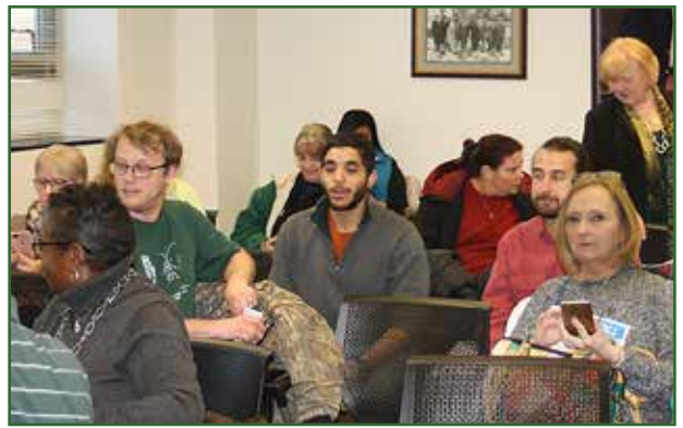
February 18, 2019—Members socialize before the Membership Meeting.