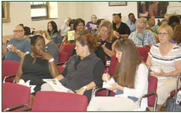
July 13 Membership Meeting—Members socialize before the meeting begins.

Unit reorganizations have caused some disruptions recently, Place said, but only