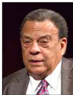
Andrew Young.

President Jimmy Carter awarded him the Presidential Medal of Freedom and France awarded him the Legion d'Honneur, the greatest civilian honor in each nation.