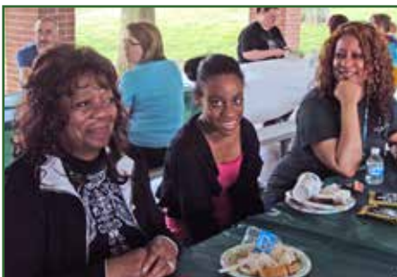
Many members brought along friends, family and co-workers to share the fun.