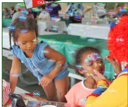
Above, Apples the Clown paints children's faces while bubbles float throughout the pavilion.