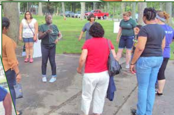
Above, our ever popular cake walk. Left, the first winner of a cake.