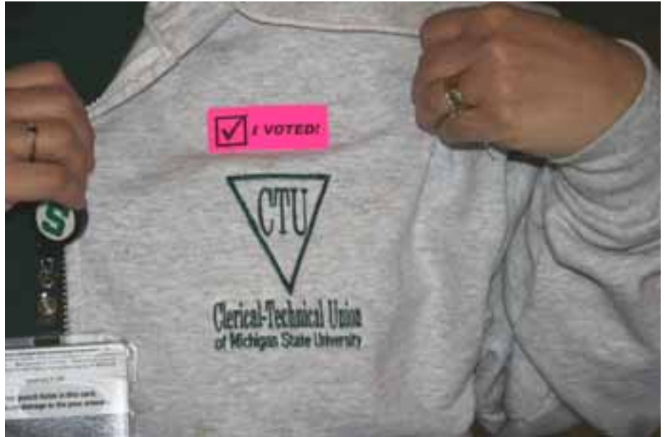
February 3, 2010—CTs voted 302 to 40 to accept the tentative agreement that establishes health care and wages for the next four years. Two unions rejected the agreement.

“CTs recognize the value of a contract like this during these difficult economic times,” she said.