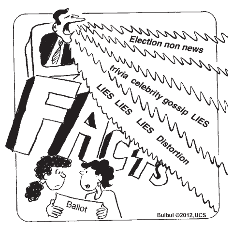
"Wonder why we are uninformed on the issues that effect our lives."

The sites listed here, along with others we might find helpful, will be available on the CTU website at www.ctumsu.org .