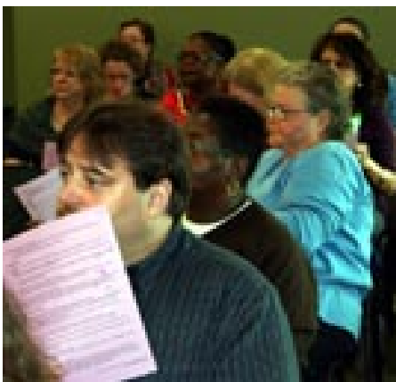
April 19—CTs received the audit report for 2010 and reviewed the 2011 budget.

Because of the lack of a quorum, we were unable to vote on replacements for the recently vacated positions of vice-president and director. Therefore, Meeting continued on p. 4