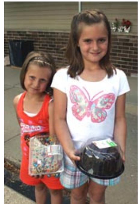
These proud sisters show off their winnings. They were the first to win baked goods in CTU’s popular cake walk. See more picnic photos at www.ctumsu.org .