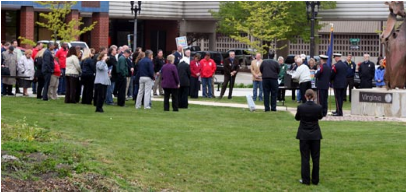
April 26, Lansing—CTU participated in the Lansing commemoration of Workers' Memorial Day this year.