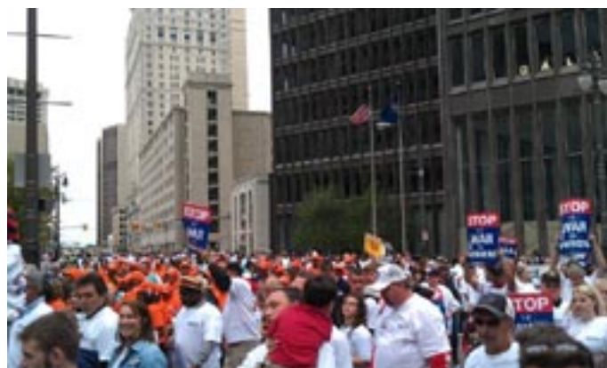
Detroit Labor Day Parade, Sept. 5, 2011 (from the Working Michigan website at http://www.facebook.com/WeAreThePeopleMI ).