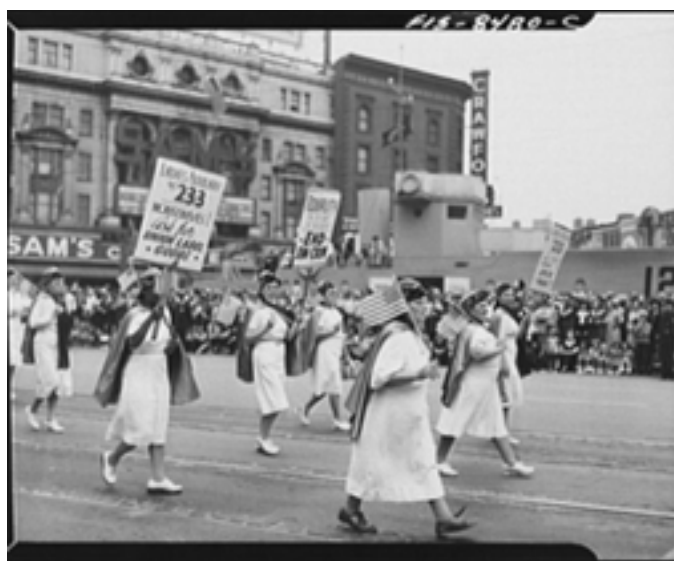
Women Workers in the 1942 Detroit Labor Day Parade (Arthur S. Siegel).

More information about CTU's 2011 elections is available on page 4.